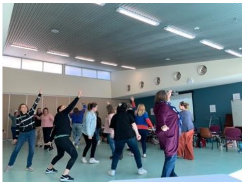
Above: Using movements