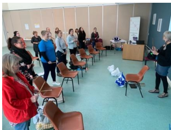
Above: Chairs and rhythm sticks – “we love to play the chairs”