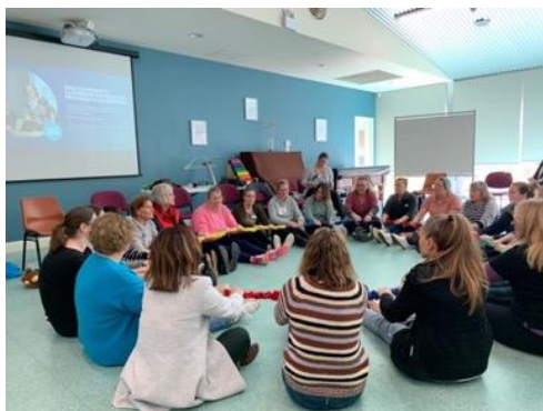
Above: Circle activity, all holding elastic ring