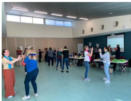
Partner rhythm games