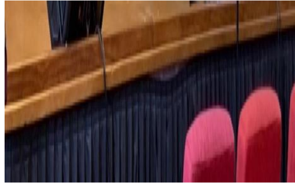
String Ensemble from Marryatville HS