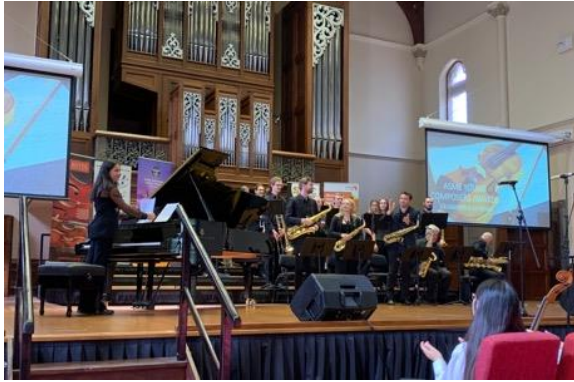
Adelaide Big Band