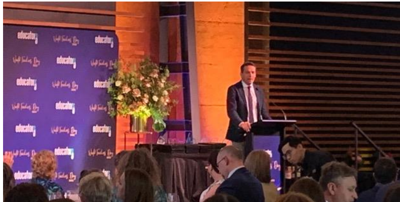
Above: Blair Boyer, Minister for Education