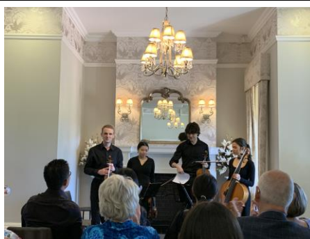
A wonderful performance from an AdYO String Quartet at Partridge House