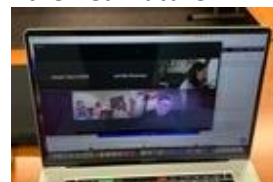
Above: Planning session by ASME (SA) Council members in-person and online

SACE-Space will return once again in both in-person and online format, on Saturday 22nd February . Thanks in advance to Seymour College for their willingness to host the event. We're excited this year to offer participants a full day of professional learning, aimed at providing attendees with quality networking and supported group workshopping to ensure every SACE Music Teacher feels confident in their ability to lead students to success this year. You can now book your tickets online via this link . Other future networking events for music educators include potential online events, an AI for music education workshop, continued delivery of our 'Music: Can Do!' primary teachers training package as part of the DfE SA Music Education Strategy, and, of course, the 2025 Young Composers Awards.