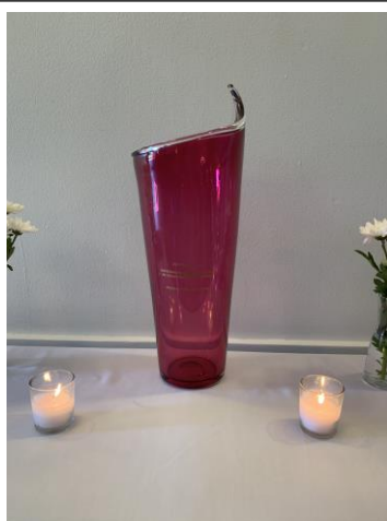
Ruby Award – on display at AdYO chamber music concert at Partridge House

I was also lucky enough to attend Musica da Camera , an afternoon concert of chamber music that was held in the beautiful Partridge House at Glenelg. Providing such chamber music experience is an excellent opportunity for students, and it made for a delightful afternoon.