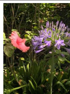
Hibiscus & agapanthus in the beautiful grounds of Partridge House